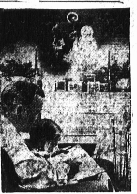
AN AGE-OLD STORY RETOLD. "She brought forth her first-born Son, and wrapped him in swaddling clothes, and laid Him in a manger."

Today's Santa Claus is by no means streamlined, but he is a far cry from the lean, ascetic, somberly dressed fellow who, for centuries, on Christmas Eve, guided his mare through the streets of Europe.