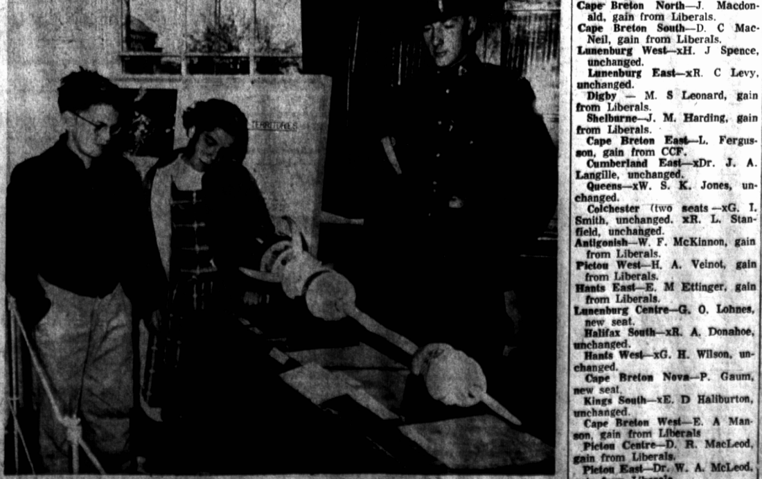
LOCAL STUDENTS INTERESTED IN MACE