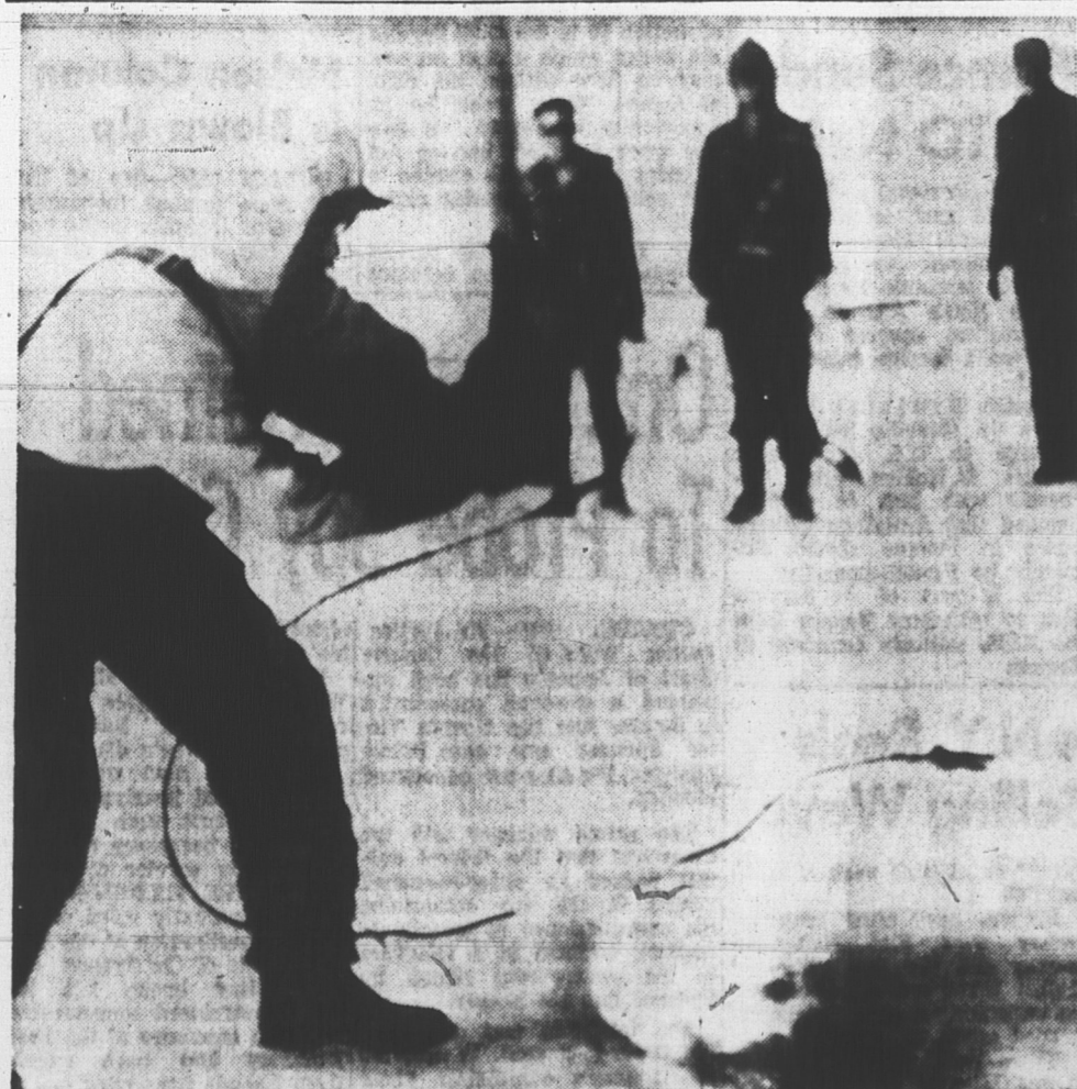
SLAUGHTER SEALS A seal hunter, one of hundreds who swarmed off ships and planes to Gulf of St. Lawrence ice Monday, swings his club to kill a seal pup. Filmed scenes such as this have stirred violent protests from animal lovers. Humane Society officials are watching the hunt closely this year.