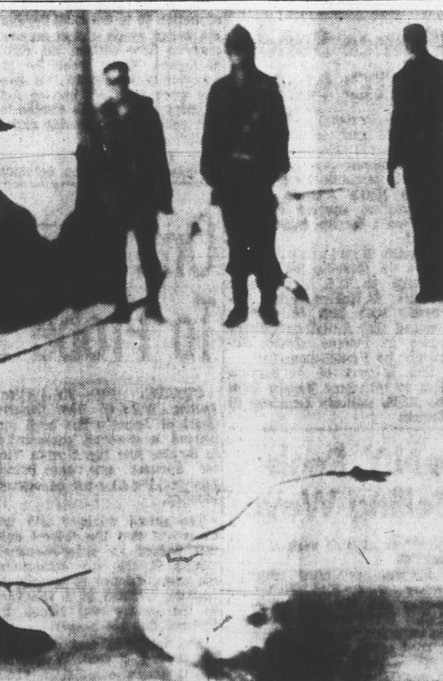
SLAUGHTER SEALS A seal hunter, one of hundreds who swarmed off ships and planes to Gulf of St. Lawrence ice Monday, swings his club to kill a seal pup. Filmed scenes such as this have stirred violent protests from animal lovers. Humane Society officials are watching the hunt closely this year.