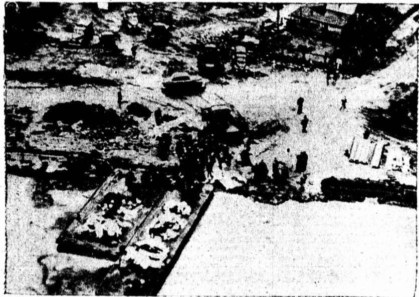
BUILDING UP THE LEVEE — In sandbags to bolster the levee, the flood problems. The rampant Missouri River already stands at 30.2 feet in the area and is expected to go higher.

OTTAWA, April 22—(OP)—The documentary film short, "Newfoundland Scene," produced by Crawley Films of Ottawa, has been named "film of the year" in the 1951 Canadian film awards.