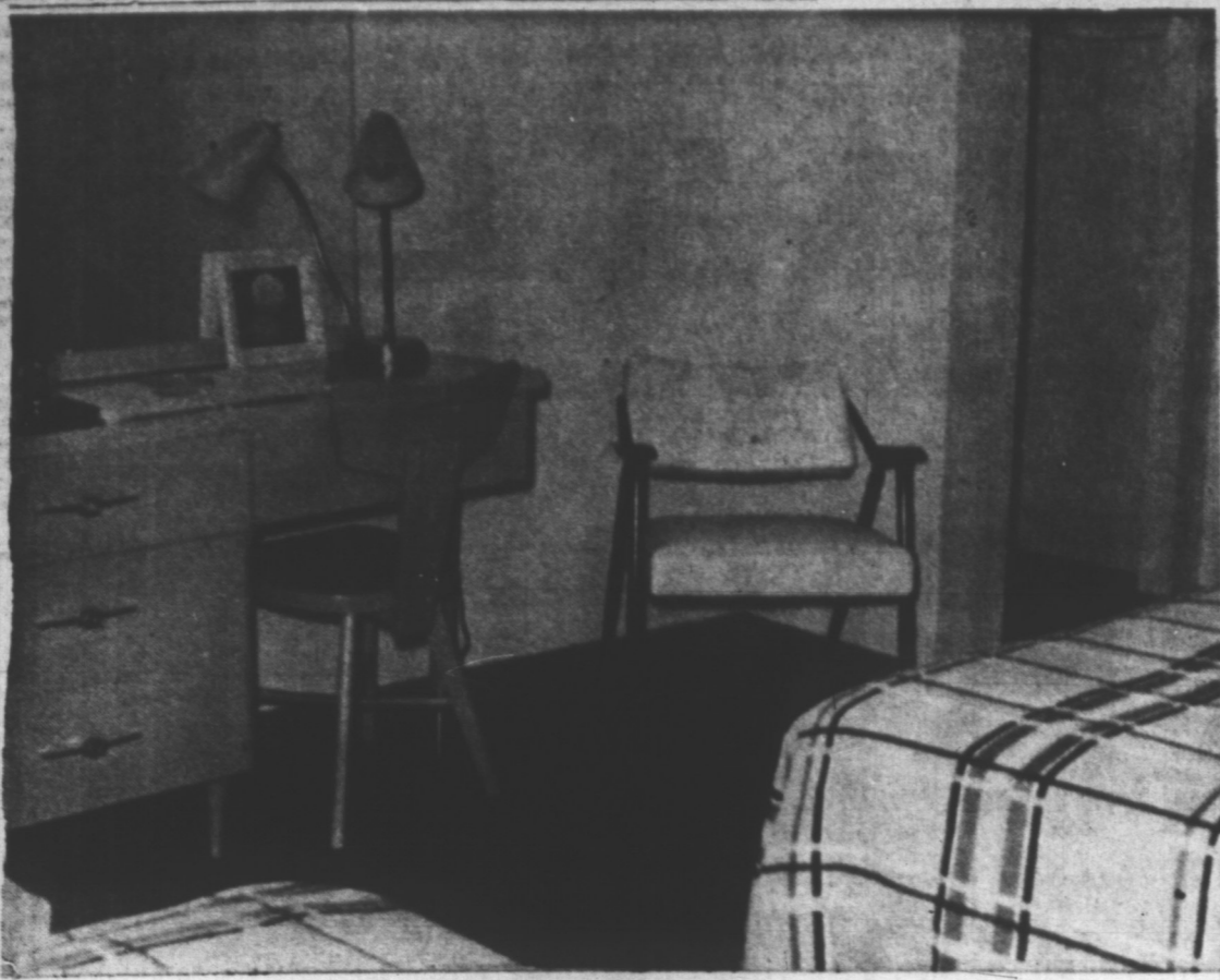
NEW MOTEL INTERIORS ARE ATTRACTIVE