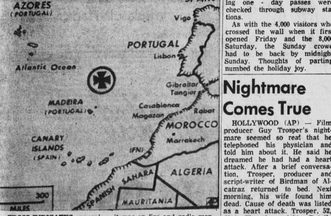
CROSS INDICATES approximate location where the Greek cruise liner Lakonia reported

LONDON (CP-Reuters)—The British ship Montclair early today started picking up survivors from the blazing Greek cruise ship Lakonia in the Atlantic about 180 miles north of Madeira, a Greek Line spokesman said here. The British ship steamed to aid the 20,338-ton Lakonia after the radioed that her 1,000 passengers and crew were abandoning ship. Seas were reported generally high in the area with winds up to 20 knots. A message sent from the Lakonia evening at 12:22 a.m. (12:20 P.E.S.T. Sunday) said: "508 from the Lakonia last time. I cannot say anymore in the wireless station. We are leaving the ship. Please immediate assistance. Please help." A spokesman for the Greek Line said in London the Lakonia was carrying about 650 passengers, most of them from Britain. She has more than 300 crew. Her master is Captain M. N. Zarba. Three ships were reported making for the disaster scene at top speed. Most of the passengers were believed to be British. New York, N.Y., Coast Guard said there were 18-20 knot winds in the area and seas were running high.