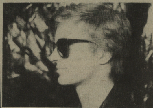
Band members ... Doctor Puberty ...