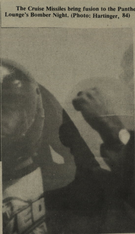
The Cruise Missiles bring fusion to the Panther Lounge's Bomber Night.