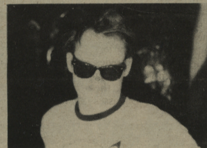
Moonrat Hanging ...