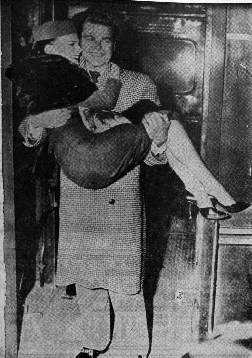
HONEYMOON SWILES Actress Natalie Wood is carried from train at Pennsylvania station by bridegroom actor Robert Wagner. They were wed December 28 in the West and have been in New York to continue honeymoon and see Broadway shows for two weeks.