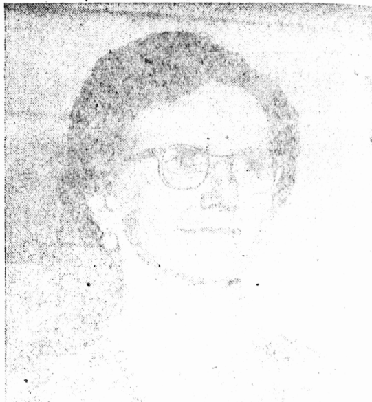
Backs Are Winning By...