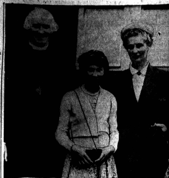
RED DEAN VISITS CHINA

The Red Dean of Canterbury, Dr. Hewlett Johnson, and his family look happy as they anticipate their vacation trip to China. They are spending some time in Soviet