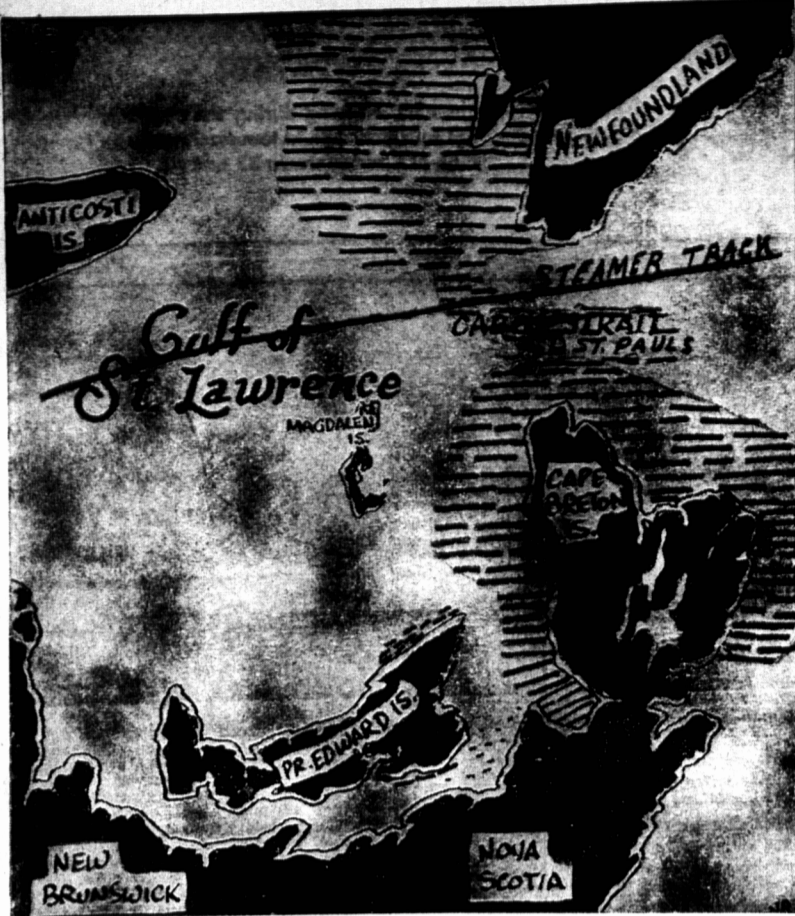
THE ICE FIELDS MONDAY