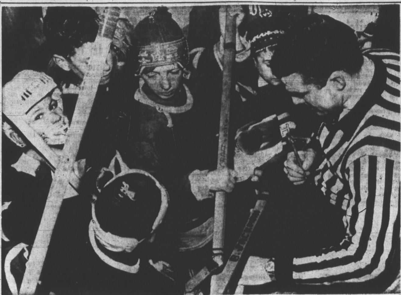
NO ROOM TO MOVE