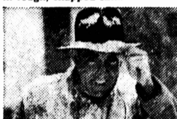
Chapped Lips. He-men suffer from icy winds and snow. Dad will be grateful for the comfort medicated Noxzema brings to dry, chapped lips—chapped, wind-burned skin.