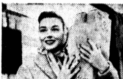
Rough, Dried-out Hands feel smoother and look prettier as soon as you apply Noxzema. This unique medicated formula helps heal and beautify. Use it faithfully.

Giant $10 oz. jar only $1.25 Limited Time Offer! Made in Canada