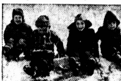
Sore, Chapped Faces, Hands. Children playing in snow and wind need soothing Noxzema to help heal all those painful tiny cracks in rough, chapped skin.