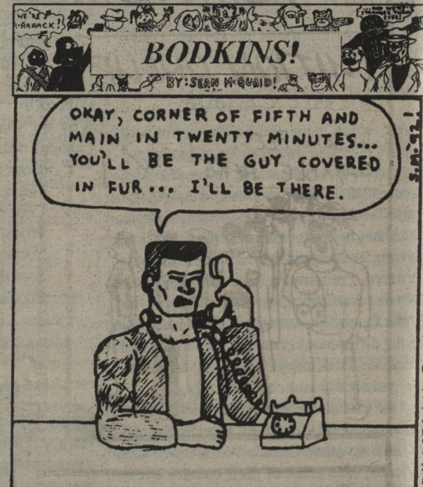
FRANKENSTEIN MEETS THE WOLF-MAN.