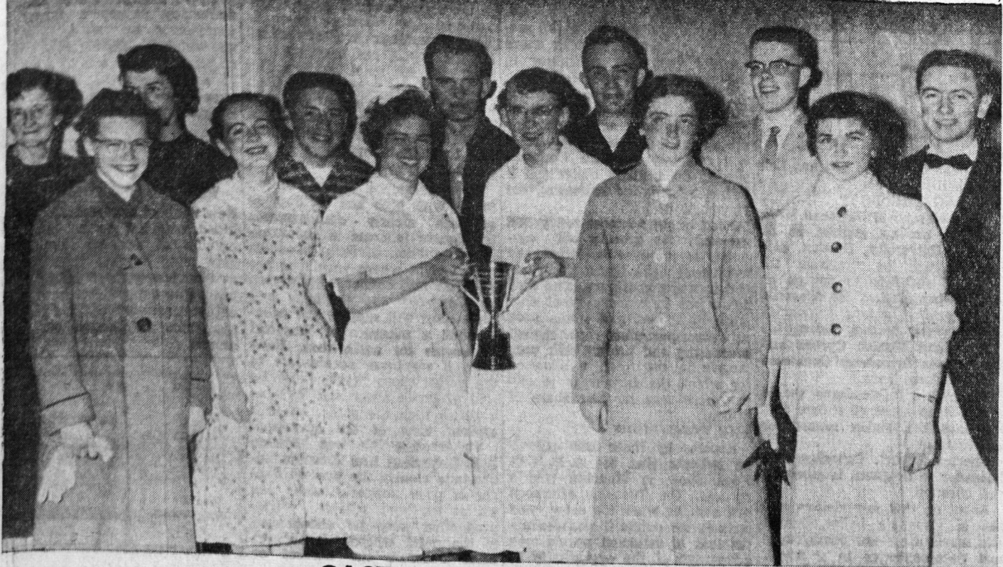
CAST OF WINNING PLAY