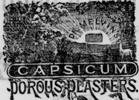
The Greatest Medical Discovery since the Creation of Man, or since the Commencement of the Christian Era.