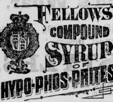
The Promoter and Perfector of Assimilation.

FELLOWS' COMPOUND SYRUP OF HYPO-PHOS-PHITES The Reformer and Vitalizer of the Blood. The Producer and Invigorator of Nerve and Muscle. The Builder and Supporter of Brain Power. Fellows' Compound Syrup is composed of Ingredients identical with those which constitute Healthy Blood, Muscle and Nerve and Brain Substance, whilst Life itself is directly dependant upon some of them. By its union with the blood and its effect upon the muscles, re-establishing the one and toning the other, it is capable of effecting the following results:— It will displace or wash out tuberculous matter, and thus cure Consumption. By increasing Nervous and Muscular Vigor, it will cure Dyspepsia, feeble or interrupted action of the Heart and Palpitation, Weakness of Intellect caused by grief, weary, overtax or irregular habits, Bronchitis, Acute or Chronic, Congestion of the Lungs, even in the most alarming stages. It cures Asthma, Loss of Voice, Neuralgia, St. Vitus Dance, Epileptic Fits, Whooping Cough, Nervousness, and is a most wonderful adjunct to other remedies in sustaining life during the process of Diphtheria. Do not be deceived by remedies bearing a similar name; no other preparation is a substitute for this under any circumstances. Look out for the name and address J. I. FELLOWS, St. John, N. B., on the yellow wrapper in watermark, which is seen by holding the paper before the light. Price $1.50 per Bottle, six for $7.50. Sold by all Druggists. Dec. 6, 1877.