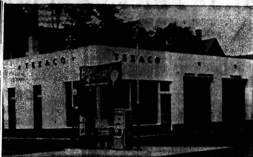
The New Queen Street Texaco Service Station