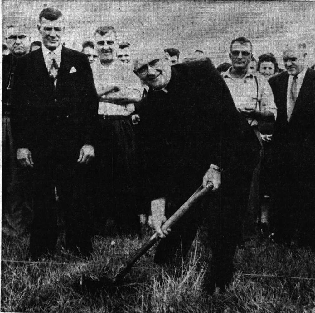
SOD-TURNING AT TIGNISH

MIAMI, Fla. (AP)—A new area of suspicion developed in the tropical Atlantic Tuesday while storm Fifi drifted along on a path that will take it well east of the U.S. mainland. Latest area of circulating winds which a forecaster said "can potentially develop into a tropical storm" was about 500 to 700 miles east of the Windward Islands and 2,000 miles southeast of Miami. Winds there were estimated at about 20 miles an hour and blowing counterclockwise, a condition that often presages formation of a storm. Meanwhile, Fifi was about 575 miles south southwest of Bermuda. It was nearly stationary or possibly drifting slowly north-northwestward with a gradual turn to the north indicated after 12 hours. Highest winds near the centre of Fifi were about 60 miles an hour and gale force winds reach outward 100 miles to the northeast and 65 miles to the southwest.