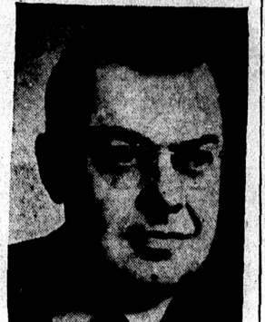
HON. PAUL MARTIN, Minister of Health, Ottawa, who has sent his congratulations to the Charlottetown Hospital in a message reprinted below.