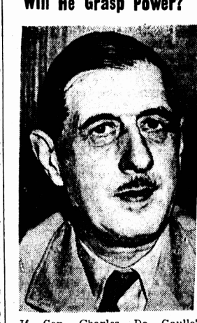
Will He Grasp Power? If Gen. Charles De Gaulle's right-wing party should step into the breach left by the resignation of Premier Edgar Faure's five-week-old government, NATO supporters fear that De Gaulle, above, would do his utmost to oppose not only Western German rearmament but also the creation of a European union. Faure's was the 16th French government since World War II.

It is reported unofficially that sometime in April, an island-owned dragger will scout the waters north of Cape Breton, and adjacent to the Magdalen Islands in an effort to locate the early spring schooling grounds of haddock, cod, and other marketable fish. The dragger may also carry equipment with which to fish the tasty and highly commercial Rose fish, or sea perch which is always a good seller on the American market. The areas which will be explored are beyond the reach or range of small near-shore fishing craft, and have not been seriously investigated in many years. Any worthwhile discoveries will be highly advantageous to the growing fleet of Island draggers, which will total five this spring and possibly eight in late summer. All of the Island owned draggers will once more be based at Souris, where considerable development and extension is being made to the fish handling facilities of the Eastern Fisheries, and the Eastern Cold Storage. Eastern Fisheries is once more—as it did last year—enlarging and improving its fish-processing building located on the Company's Wharf. Up town Eastern Cold Storage space is being greatly enlarged to keep step with the expected increase in fish landings, because of the upswing in the number of modern draggers. The enterprising Eastern Fisheries Company of Souris which brought expert fish handlers to the Province last year from Gloucester, to instruct its employees (Continued on Page 5 Col. 2)