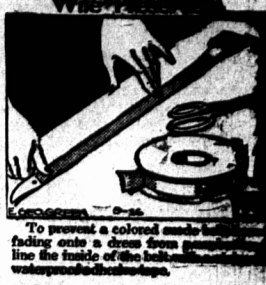
To prevent a colored mark from fading onto a dress from gunpowder line the inside of the bottom.