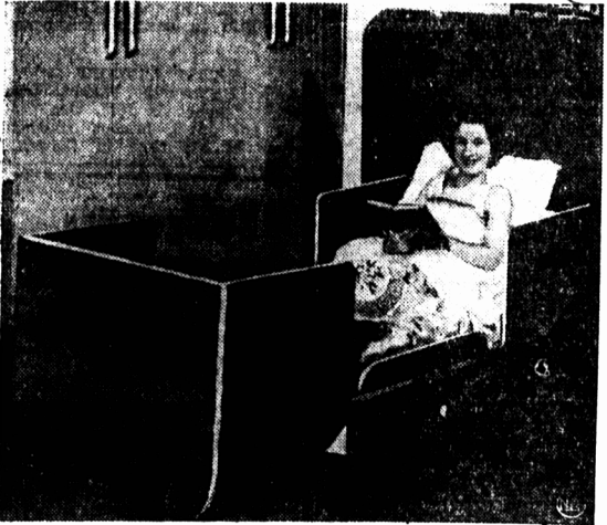
Completely unfolded, it becomes a full-length bed, occupying little more space than when used as a table.