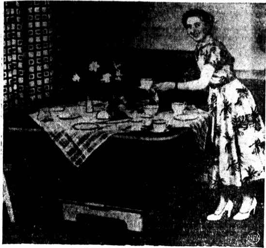
Designed for the small apartment dweller, the "Doo-Stay" can be used as a table during the day.

If you like to eat in bed, a firm in London, England, has manufactured a device which can serve as both bed and table. In 15 seconds this piece of furniture can be converted from a table to a full-length bed, according to the manufacturer. During the day mattress, sheets, blankets and pillow are folded into the bottom part of the table. Named the "Doo-Stay", it comes in two sizes, a six-seater which makes a single bed, and an eight-seater which makes a double bed. It will soon be on display in Washington, D.C.