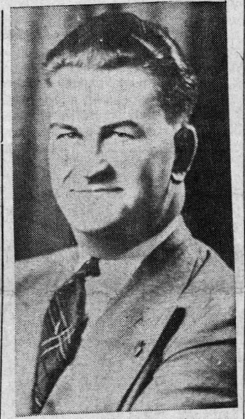
HON. MR. MACLEAN

OTTAWA (Special)—For the first time in Canada's political history, according to old-timers in Ottawa, a Prince Edward Islander occupied the post of acting Prime Minister of Canada. The Islander in question is Fisheries Minister J. Angus MacLean who was in the Prime Minister's shoes on Friday and will be in the same post until he leaves Ottawa for his native province on Saturday.