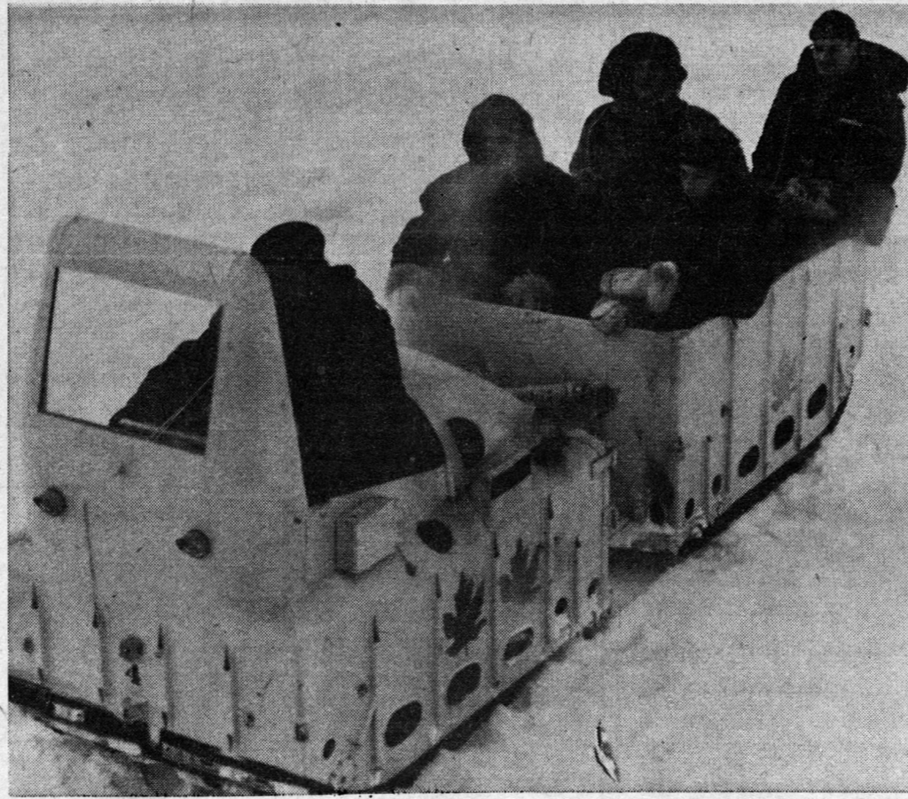
WOULD BE USEFUL HERE

AMMAN, Jordan (Reuters)—As the first step to full Arab unity, Iraq and Jordan, both pro-Western in their political sympathies, have a combined population of 6,500,000—5,000,000 in Iraq and 1,500,000 in Jordan, including 600,000 refugees from the Arab-Israeli war of 1948.