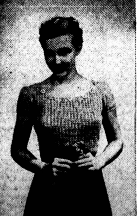
For dancing, dining or just looking pretty a pastel crocheted blouse like the one pictured above is a 'must' for every holiday wardrobe.