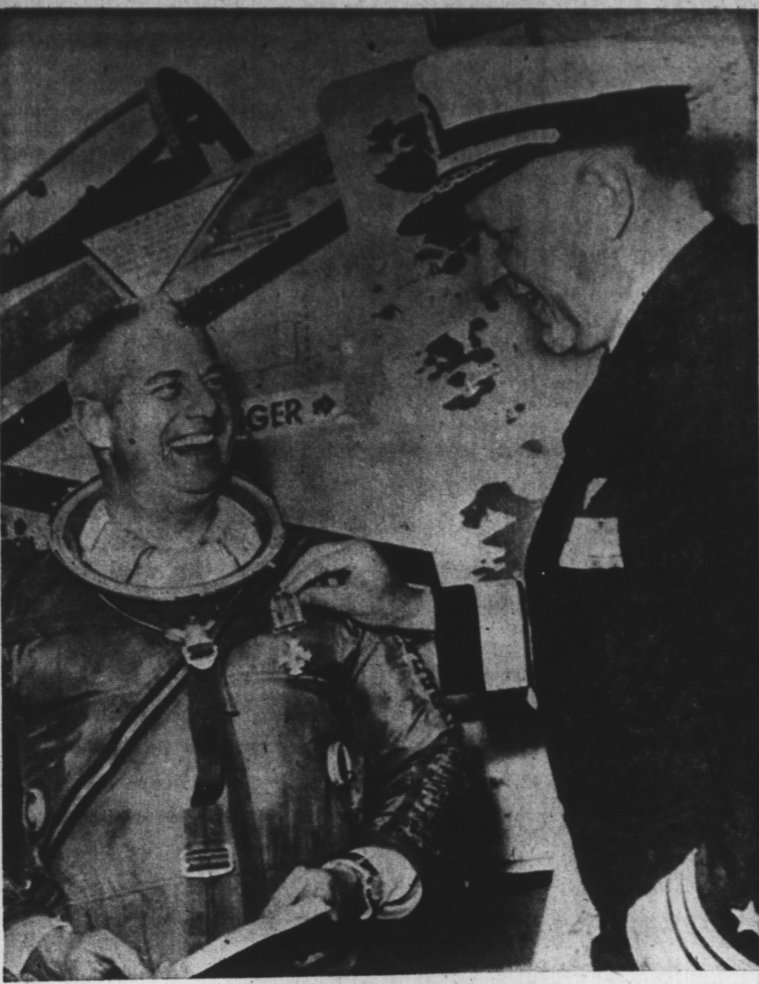
NAVY PILOT GETS DFC