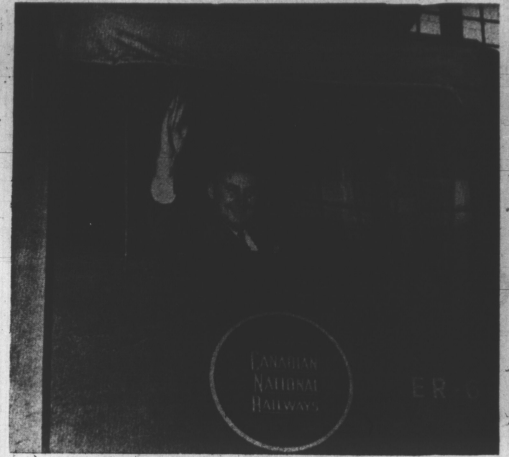
The White Hunter Brings Her To A Stop ...

TERMS • CASH • BUDGET • LAYAWAY • 2 yrs. TO PAY