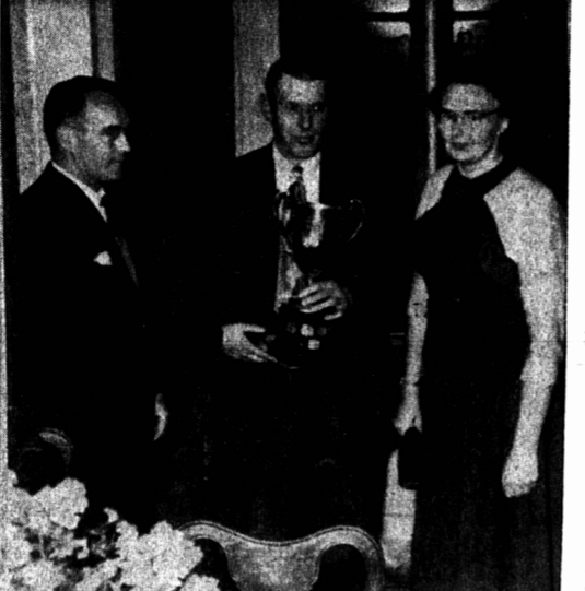
KING'S COUNTY WINNERS