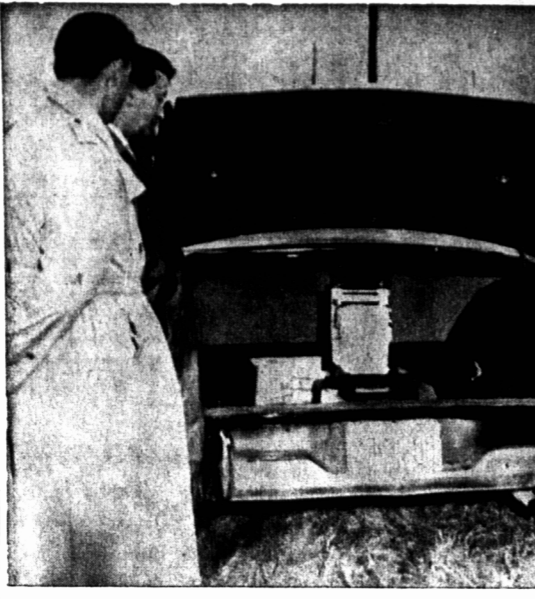
POLICE, HIGHWAY officials, demonstrated at Summerside and the Motor Vehicle Branch inspect the electronic speed meter which was available to Courts precision speed measurements free from the error of human observation.