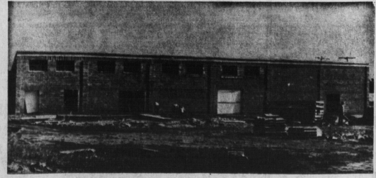
Langley Fruit Packers Ltd.

The mayor and councillors of the Town of Montague are pleased to take this opportunity to extend their "Best Wishes" to the Langley Fruit Packers Ltd. on the opening of their new food processing plant in Montague. We realize the importance of this new industry to the economy of this area and are pleased to be able to welcome them to Montague.