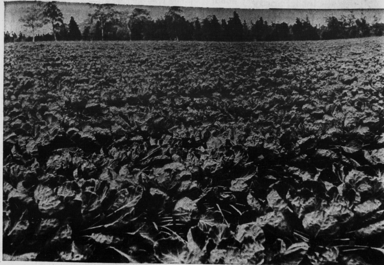
FIELD OF BRUSSELS SPROUTS NEAR PLANT IS READY FOR PROCESSING