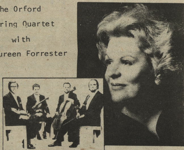
The Orford String Quartet with Maureen Forrester

The entire concert was an evening of fine music being played very well by some of the finest musicians Canada has to offer. It was a concert the likes of which we probably won't experience in Charlottetown for a long time.