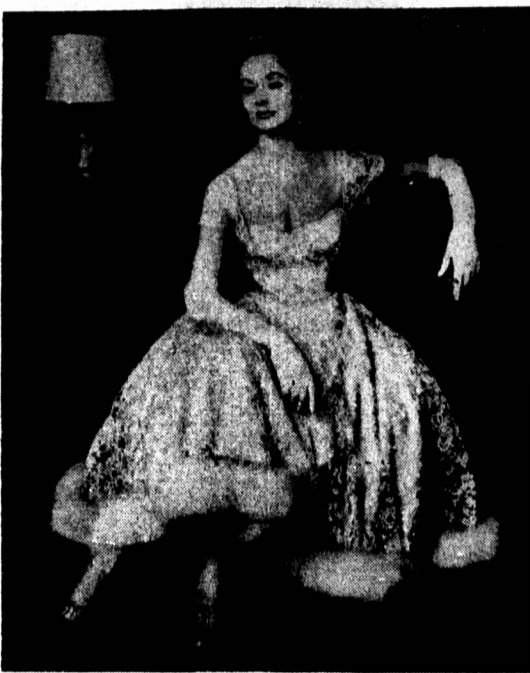
By ALICE ALDEN

For that important occasion here is a dream-come-true dress, a creation of ethereal charm yet eminently wearable. Ceil Chapman has the perfect selection, a frock that is of palest pink. Chantilly lace over pink taffeta. The dress is additionally shaped by its own nylon crinoline and to create a wonderful waltzing swirl, the hem is banded in fox dyed the same delicate pink. And as a change from the strapless bodice this one has brief sleeves.