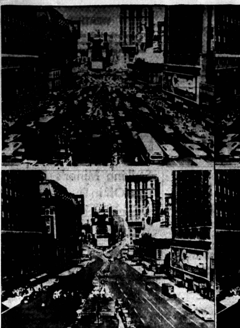
EMPTIES TIMES SQUARE

Times Square is filled with early afternoon pedestrian and vehicular traffic, but takes on a "deserted town" look moments later after sirens sounded "Operation Alert" civil defense drill.