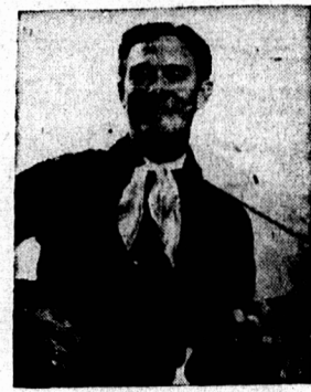
LEFTY FRIZZELL who will appear in person with his Grand Ole Opry show at the Prince of Wales College, Thursday, November 22nd.