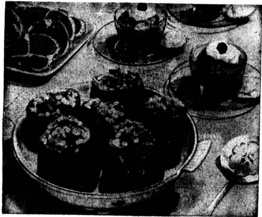
FOR DINNER WITH A DIFFERENCE, serve creole stuffed green peppers, filled with cold corned beef or ham, and a peach cream whip.

Peach Cream Whip: In a large bowl combine 2 c. chopped peeled