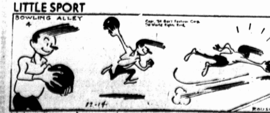
LITTLE SPORT BOWLING ALLEY