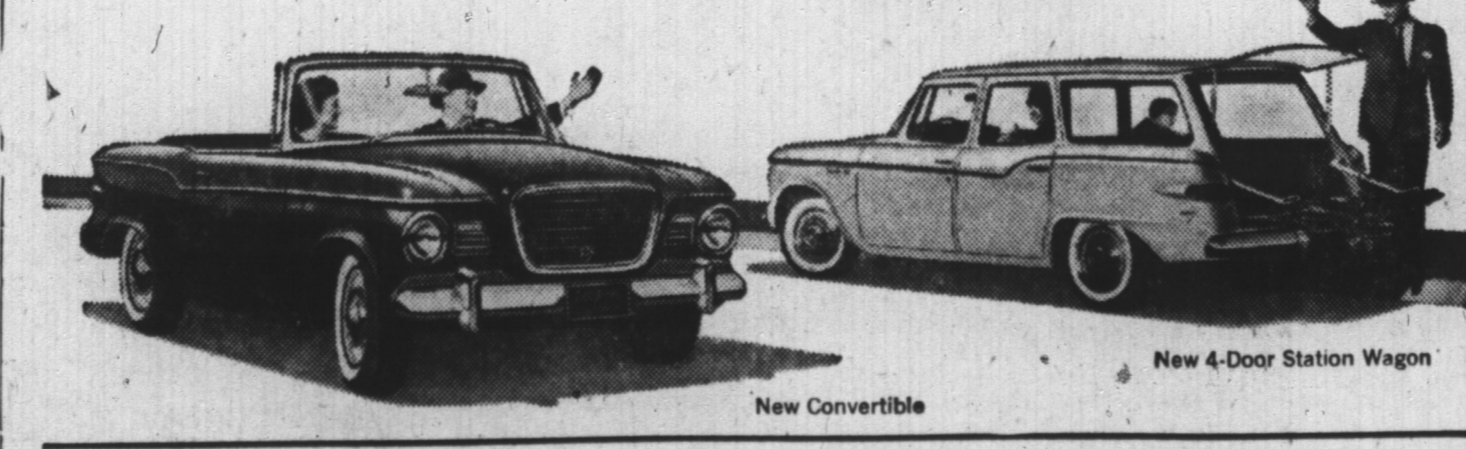
New 4-Door Station Wagon