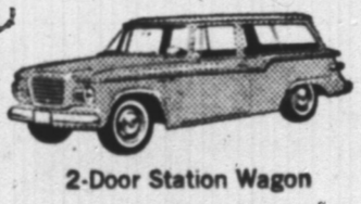
2-Door Station Wagon