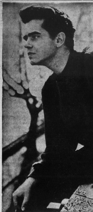
TO DO 1967 PHOTO-BOOK Painter - photographer Roloff Beny has been commissioned to do a photo-book on Canada for the 1967 centennial of Confederation. A native of