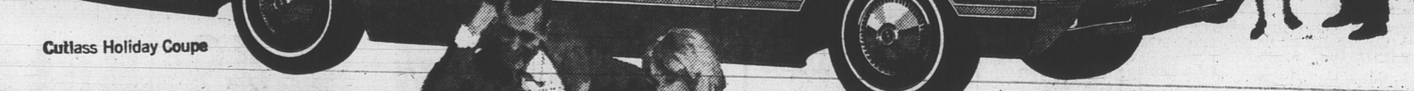
Cutlass Holiday Coupe