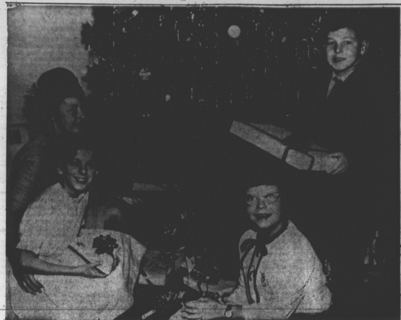
SCHOOL FOR DEAF HAS PARTY

Provincial government civil servants will more than likely find their present pension plan and the Canada Pension Plan will be integrated into one.