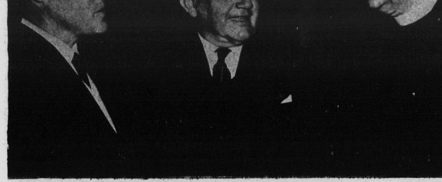
Members of the executive of the P.E.I. District of the Canadian Bible Society...

The need for a membership drive was also stressed by the president to replace those who have left the summer.