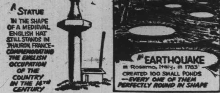
A STATUE IN THE SHAPE OF A MEDICAL ENGLISH HAT STILL STANDS IN THURLOW FRANCE—COMMEMORATING THE ENGLISH OCCUPATION OF THE COUNTRY IN THE 14TH CENTURY