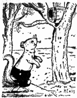
Quite high up in that tree was a queer looking object.

First find out all that you can; then you'll know just how to plan. —Chatterer the Red Squirrel.