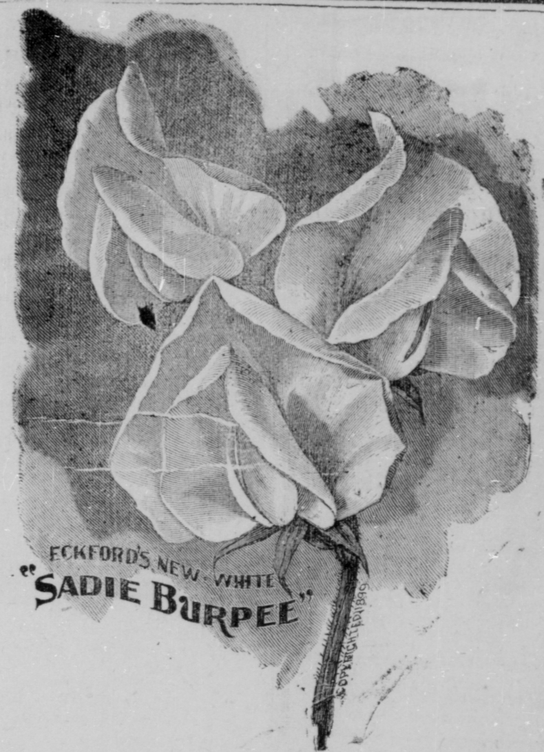
ECKFORD'S NEW WHITE "SADIE BURPEE"

Cures CHRONIC-DISEASES and RUP-TURE by Salsbury treatment. Send stamps for information, or call at Truro, Nova Scotia. Office Merchant's Bank of Halifax Building.