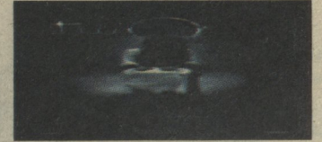
The Ring Two... p.19