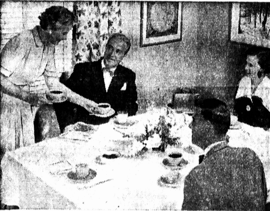
Now it's "How do you like your COFFEE?" Made just the right strength for each individual taste, "custom-made" cups of new Instant Chase & Sanborn are fast becoming a breakfast vogue among Canadian families.

At breakfast you could always get your toast light or dark—your bacon medium or well-done—your eggs 2, 3 or 4-minute boiled. But your coffee? Well, you just got coffee! The coffee might be too strong for you—it tasted bitter. Or too mild for you—it tasted weak. But if you were in the minority—too bad! After all, one pot of coffee can't satisfy everybody's taste. But then came the revolution—the "Coffee Revolution!" Now the most forgotten "little man" can get just the cup of coffee he likes! (No matter if the mother-in-law can't stand such strong coffee. Or if Cousin Joe from New Jersey demands it "blacker than your hat!") Seriously, though, it's the women who make the coffee who brought on the revolution! It was they who discovered the wonderful new Instant Chase & Sanborn, and started serving it for breakfast. First of all, here's 100% real coffee that really tastes like it. Chase & Sanborn scientists saw to that! They took on the job of producing an "instant" worthy of Chase & Sanborn's 100-year-old coffee reputation. They never relaxed till they had succeeded in extracting from the finest coffee beans the color and texture—the rich robust flavor and aroma of freshly ground coffee. Next, housewives decided that this definitely superior "instant" plainly belongs whenever and wherever coffee is served. And then, everybody caught on to the other important benefit. Cups of Instant Chase & Sanborn can be "custom-made" to each person's taste. Good-bye to the old one-pot handicap!