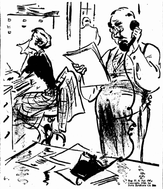
"Don't worry, I'll settle these bills just as soon as my secretary makes up with her boy friend."