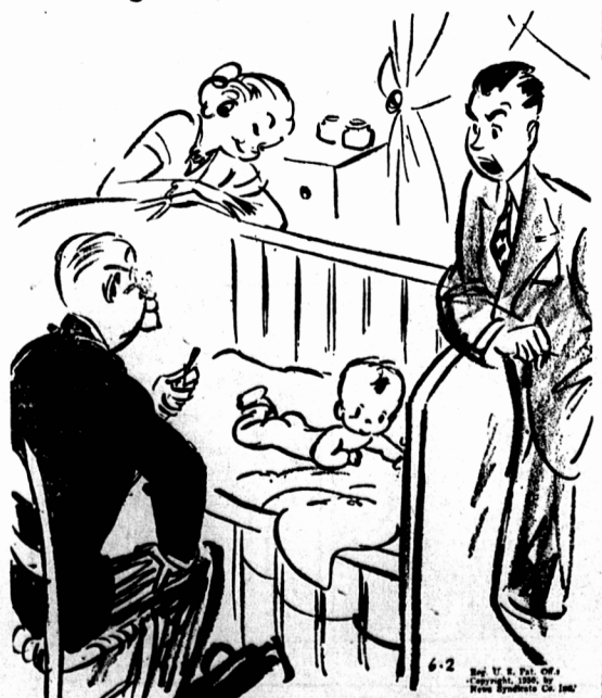
"If he doesn't get exactly what he wants he cries like a baby!"