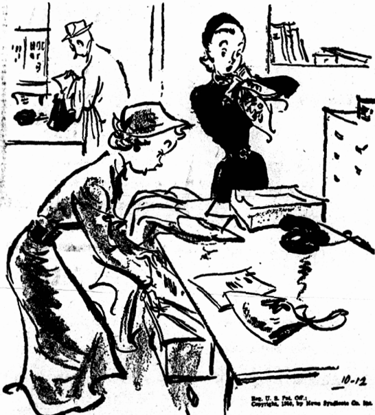
"Nobody ever sees any unfinished work on my desk. I always hide it."