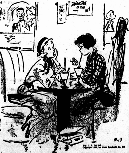
"That handsome professor is going to talk to my father about me—but I'm afraid it's only about my studies."