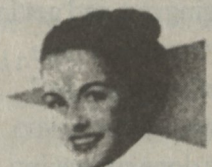
The Cadre is powerfully effective yet harmless.