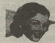
The Cadre is daintier, more convenient.

As a means of hygienic protection in feminine hygiene, a student paper is unequalled for convenience and ease. The Cadre offers so many extra advantages: