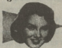
The Cadre assures hygienic protection for hours.