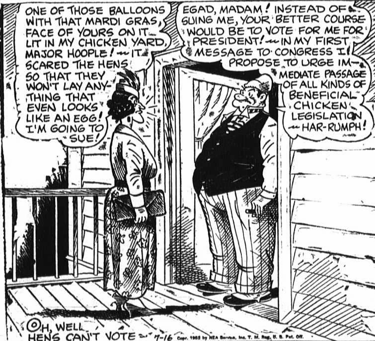
OH, WELL, HENS CAN'T VOTE 7-16