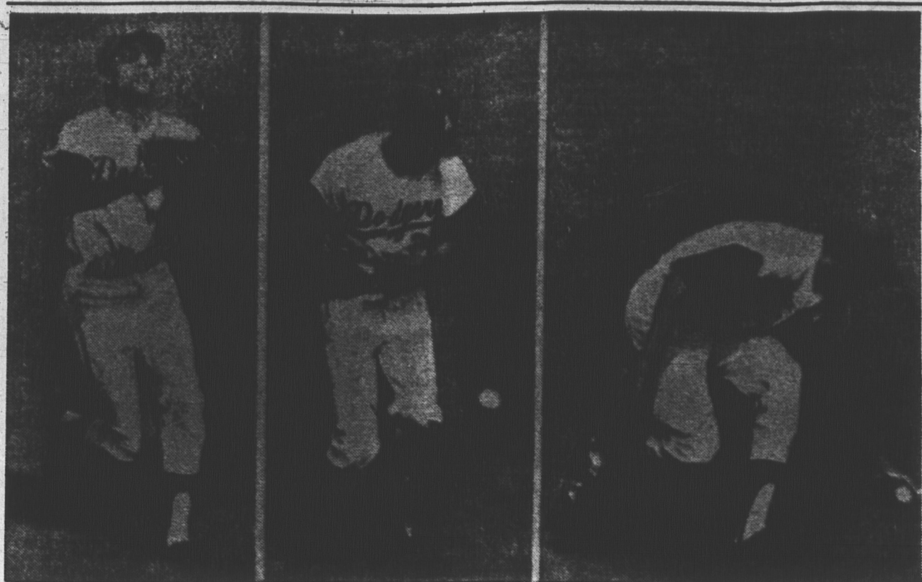
START OF WORLD SERIES RECORD