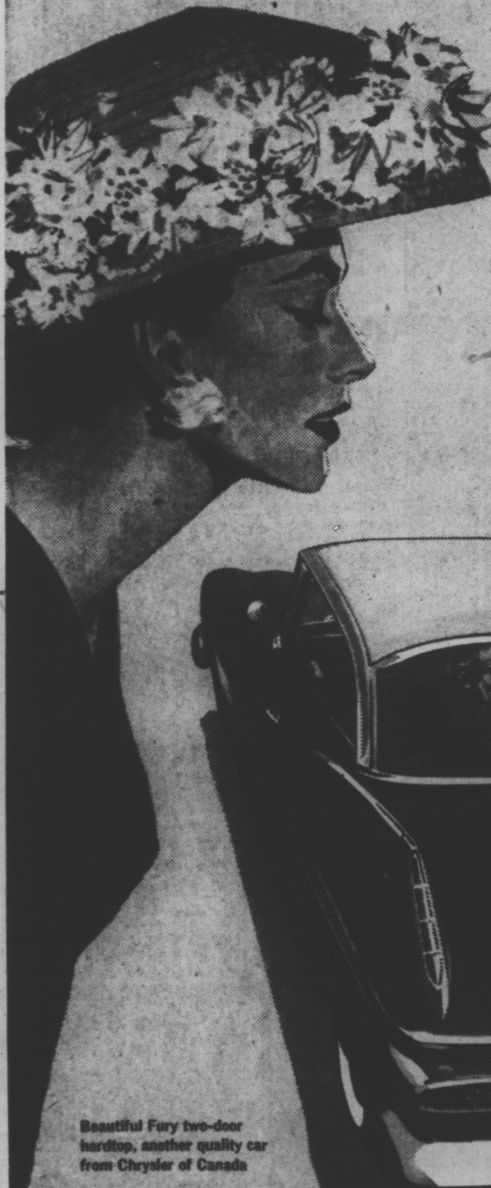
Beautiful Fury two-door hardtop, another quality car from Chrysler of Canada

Take a Plymouth big-buy test-try today... and see how much fun summer can be in a new '59 Plymouth!